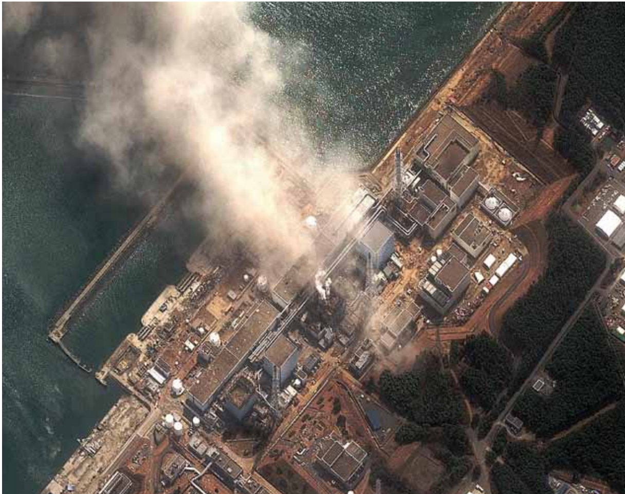
Image A satellite image shows damage at the Fukushima nuclear power plant. The damage was triggered by the offshore earthquake that occurred on 11 March 2011.

For example, even when the problems, weaknesses and scandals of TEPCO came to the surface, regulators never enforced sufficiently strong measures to avoid the same things from happening again and again and again. On occasions when regulators finally requested certain modifications, they allowed many years to go by before these were implemented. This is exactly what proved to be fatal in Japan in 2011.