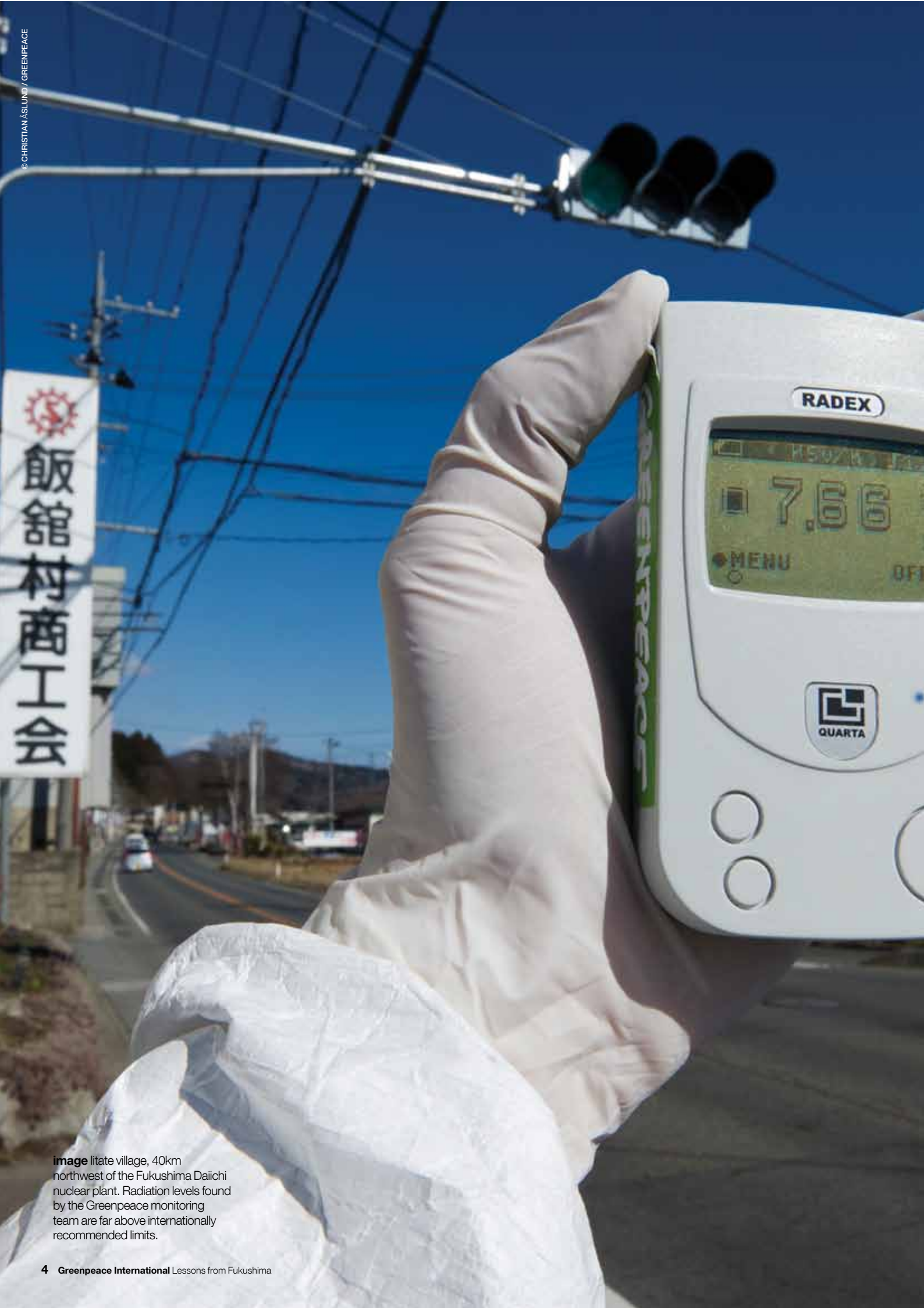
image Iitate village, 40km northwest of the Fukushima Daiichi nuclear plant. Radiation levels found by the Greenpeace monitoring team are far above internationally recommended limits.